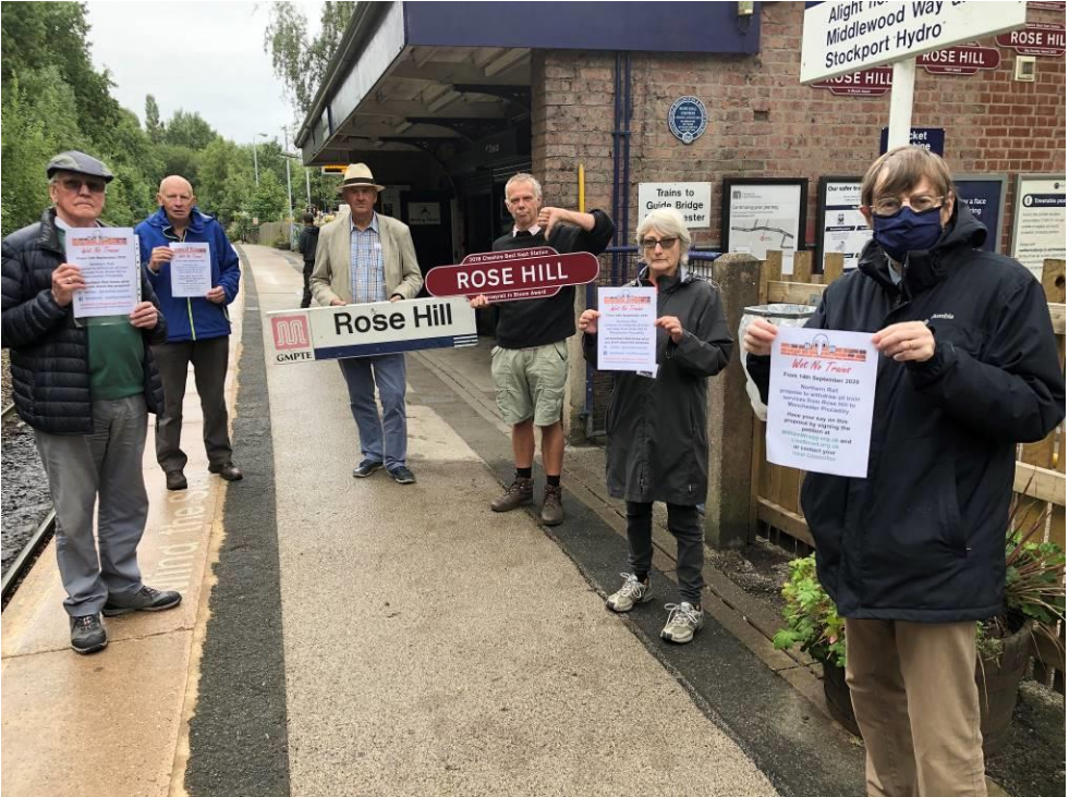
A class 150 arrives at Rose Hill Marple station in better times.