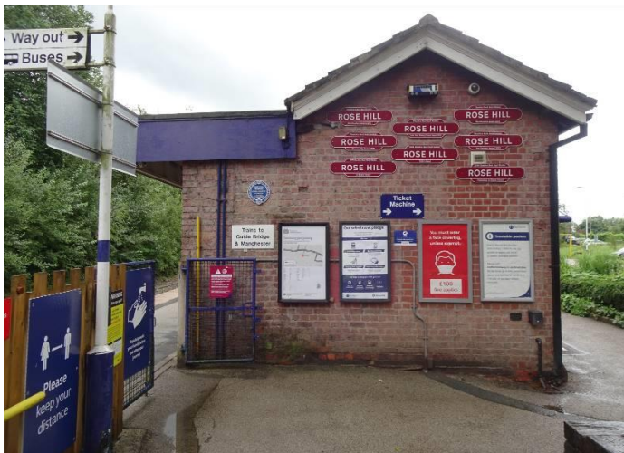
Rose Hill Station entrance.

For more information email forhs142@gmail.com or follow @forhs142 or @FoMarpleStation on Twitter.